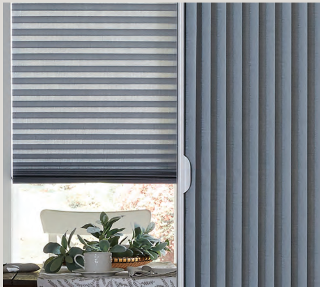
Parasol® Cellular Shades Capture the ultimate in energy efficiency and light control. Parasol offers a wide selection of fabrics in a variety of colors, textures, cell sizes and opacities.