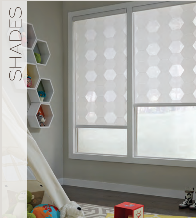
SHADES Allure® Transitional Shades Enjoy nearly endless light control and view options with the stylish Allure® Transitional Shades.