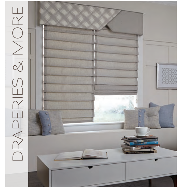
DRAPERIES & MORE Interior Masterpieces® Fabric Shades and Top Treatments Our endless design options for custom draperies, shades, bedding, pillows, and more give you the opportunity to truly create the home of your dreams.