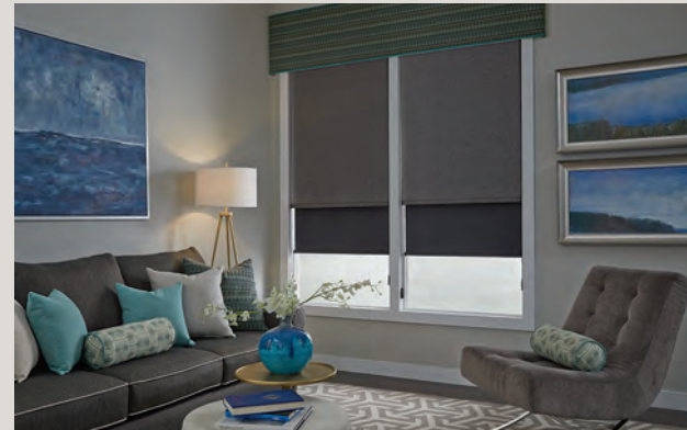
Genesis® Roller Shades The Genesis collection makes it easy to suit any need or style by offering roller shades, roman shades, panel track, and solar screen shades.