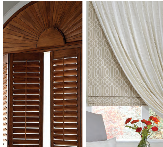
blinds shades shutters draperies & more