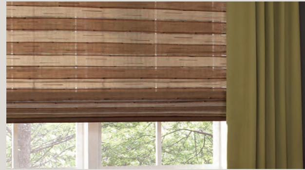
Manh Truc® Woven Wood Collection Celebrate the ancient art of weaving natural elements and bring texture into your home. The unique nature of this product makes each window covering truly distinctive.