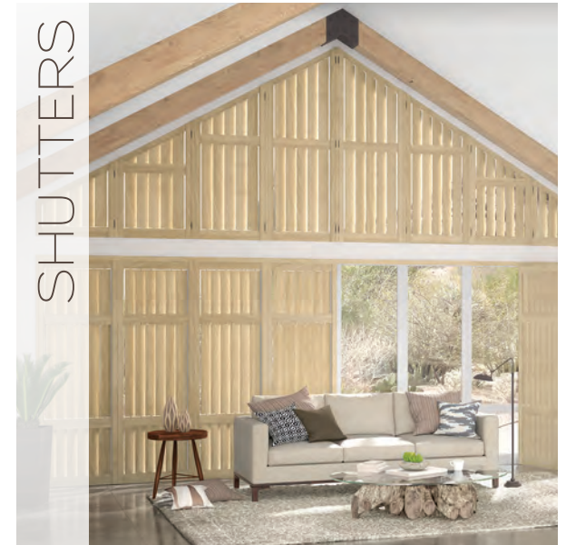
SHUTTERS Woodland Harvest® Shutters Lafayette leads the industry with our truly custom shutters by combining the right balance of innovation and craftsmanship.