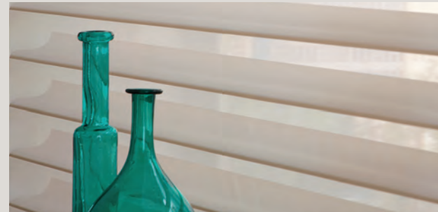
Tenera® Sheer Shadings Create the degree of privacy you desire with these beautiful and uniquely-shaped window fashions. Choose from an array of translucent or room dimming fashion-forward fabrics to transform harsh daylight.