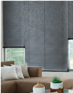
Classic Collection™ Aluminum