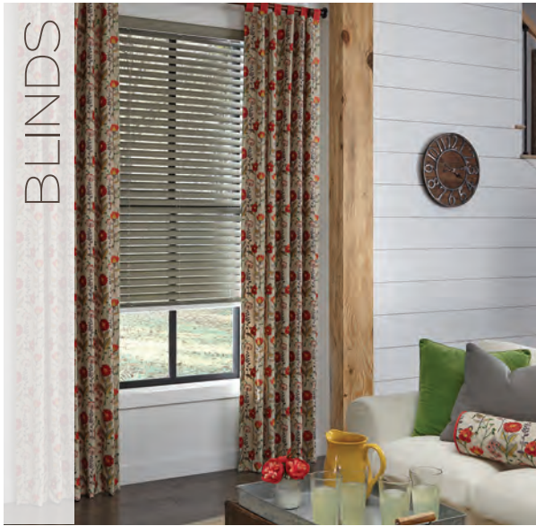
BLINDS Heartland Woods®, Fidelis®, and Wonderwood® Direct the light from left to right or floor to ceiling with our horizontal and vertical blinds.